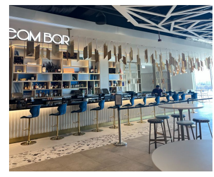
American Dream Bar