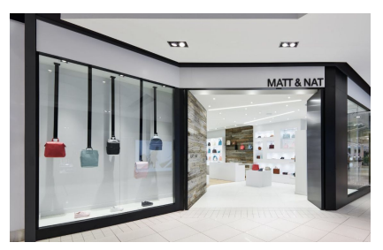
Mat & Nat Store